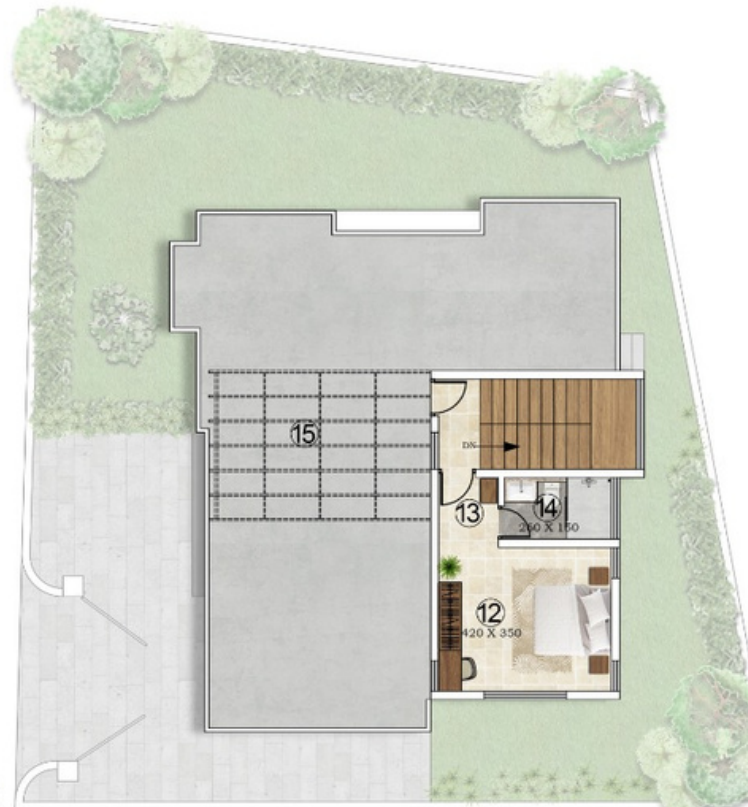
Green Acres Type 2 - GF