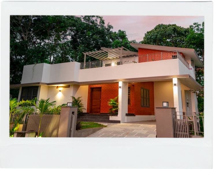
View from Site